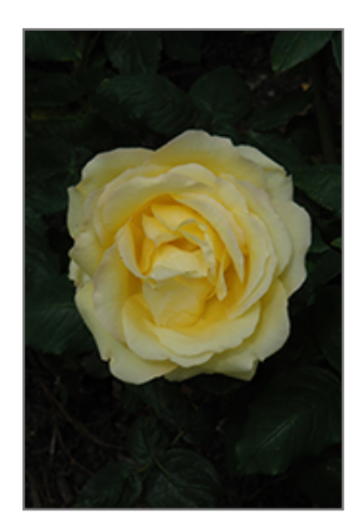
Easy Going Rose flowers