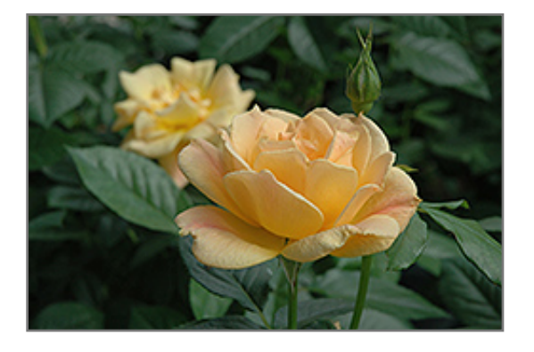
Easy Going Rose flowers