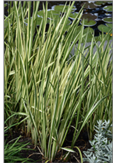
Variegated Sweet Flag

Variegated Sweet Flag is recommended for the following landscape applications;