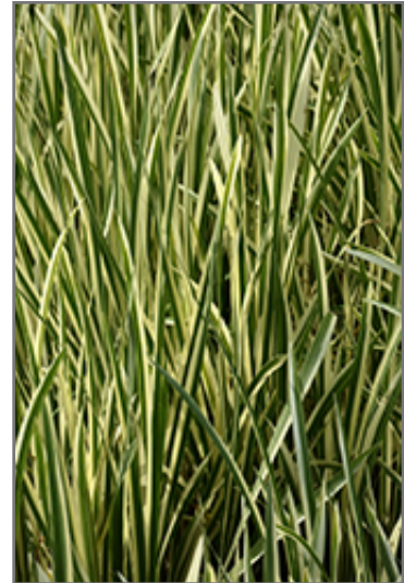
Variegated Sweet Flag foliage

Variegated Sweet Flag will grow to be about 4 feet tall at maturity, with a spread of 3 feet. Its foliage tends to remain dense right to the ground, not requiring facer plants in front. It grows at a medium rate, and under ideal conditions can be expected to live for approximately 10 years. As an herbaceous perennial, this plant will usually die back to the crown each winter, and will regrow from the base each spring. Be careful not to disturb the crown in late winter when it may not be readily seen!