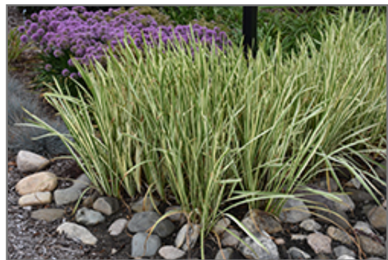
Variegated Sweet Flag