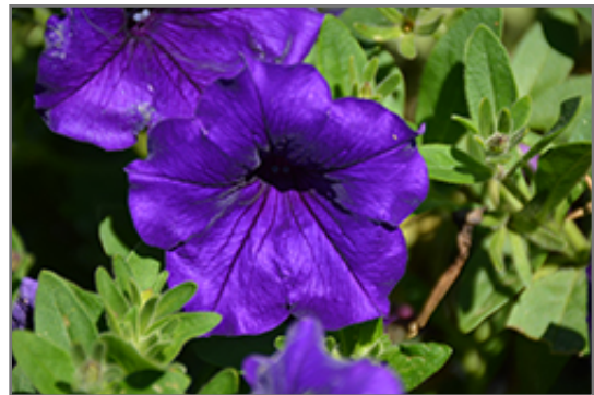
Easy Wave Blue Petunia flowers