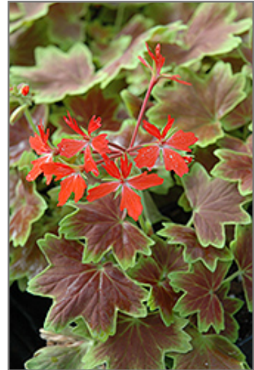
Vancouver Centennial Geranium flowers