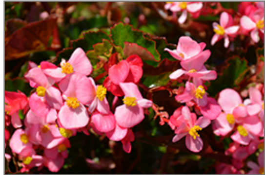
BabyWing Pink Begonia flowers