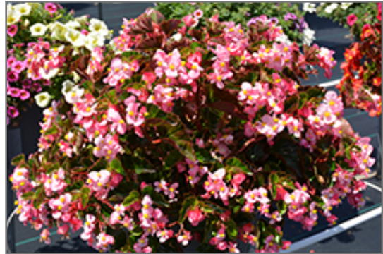
BabyWing Pink Begonia in bloom

BabyWing Pink Begonia is a fine choice for the garden, but it is also a good selection for planting in outdoor containers and hanging baskets. It is often used as a 'filler' in the 'spiller-thriller-filler' container combination, providing a mass of flowers and foliage against which the thriller plants stand out. Note that when growing plants in outdoor containers and baskets, they may require more frequent waterings than they would in the yard or garden.