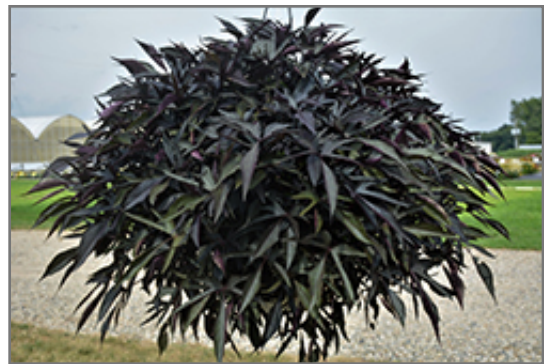
Illusion Midnight Lace Sweet Potato Vine