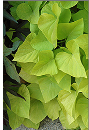
Marguerite Sweet Potato Vine foliage

Marguerite Sweet Potato Vine will grow to be only 6 inches tall at maturity, with a spread of 3 feet. Its foliage tends to remain low and dense right to the ground. This fast-growing annual will normally live for one full growing season, needing replacement the following year.