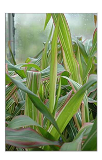
Field Of Dreams Ornamental Corn foliage

This plant does best in full sun to partial shade. It prefers to grow in average to moist conditions, and shouldn't be allowed to dry out. It is not particular as to soil type or pH. It is somewhat tolerant of urban pollution. This is a selection of a native North American species.