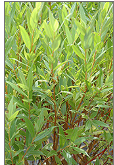
Flame Willow foliage