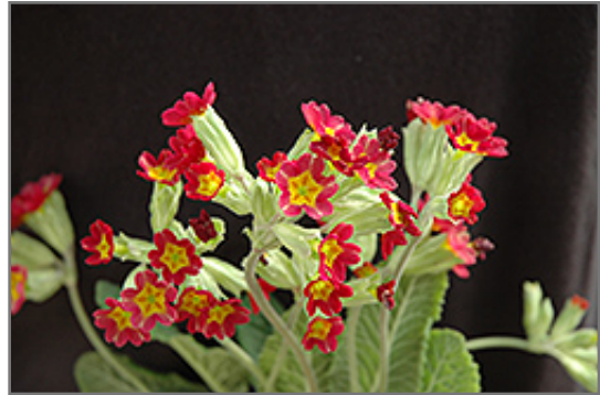
Sunset Shades Cowslip flowers