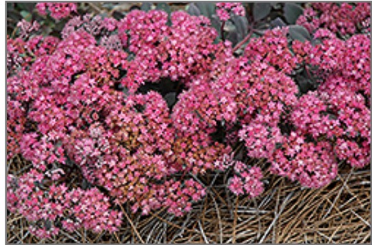
Dazzleberry Stonecrop flowers

Dazzleberry Stonecrop is a dense herbaceous perennial with an upright spreading habit of growth. Its medium texture blends into the garden, but can always be balanced by a couple of finer or coarser plants for an effective composition.