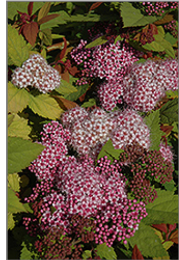
Double Play Big Bang Spirea flowers

Double Play Big Bang Spirea is recommended for the following landscape applications;