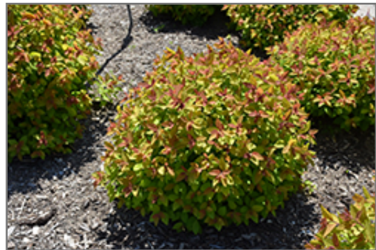
Double Play Big Bang Spirea