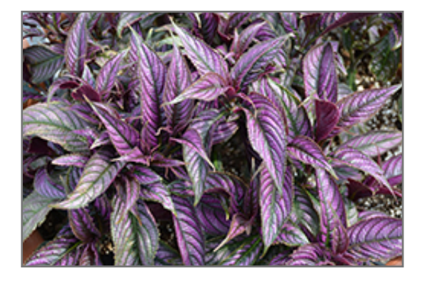
Persian Shield foliage