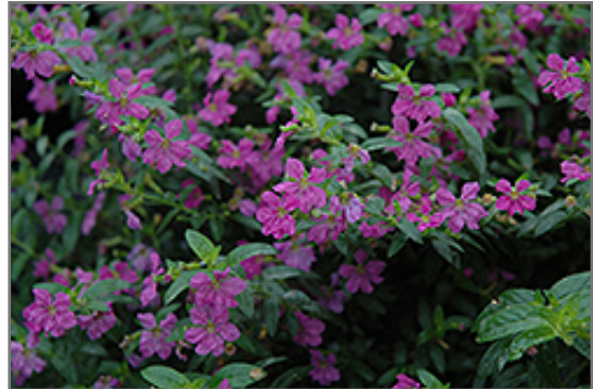
Allyson Mexican Heather flowers