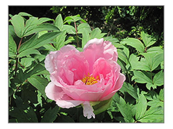
Hanakisoi Tree Peony flowers