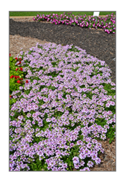
Lanai Twister Purple Verbena in bloom