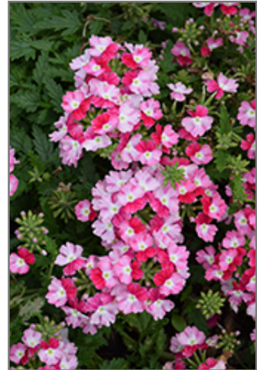
Lanai Twister Red Verbena flowers

Lanai Twister Red Verbena is recommended for the following landscape applications;