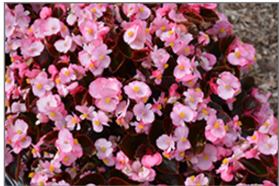
Nightife Pink Begonia flowers