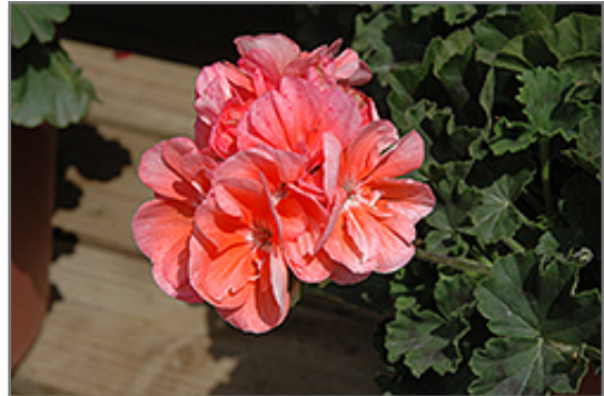
Moonlight Light Salmon Geranium flowers

Moonlight Light Salmon Geranium features bold balls of lightly-scented salmon flowers with white edges at the ends of the stems from late spring to early fall. The flowers are excellent for cutting. Its tomentose round palmate leaves remain green in colour with prominent brown stripes throughout the year.