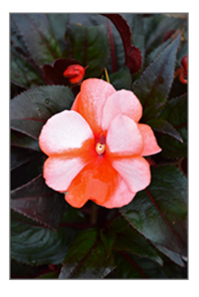
Sonic Sweet Orange New Guinea Impatiens flowers

This plant will require occasional maintenance and upkeep, and should not require much pruning, except when necessary, such as to remove dieback. It has no significant negative characteristics.