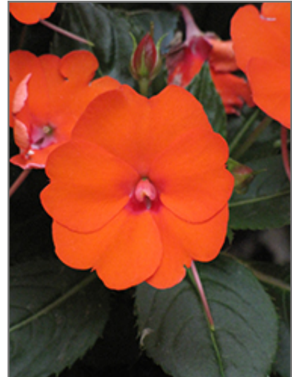
SunPatiens Compact Electric Orange New Guinea Impatiens flowers

This plant will require occasional maintenance and upkeep, and should not require much pruning, except when necessary, such as to remove dieback. It is a good choice for attracting bees and butterflies to your yard. It has no significant negative characteristics.