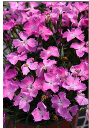
Kahori Pink Pinks flowers