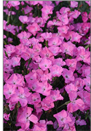
Kahori Pink Pinks flowers

Kahori Pink Pinks is recommended for the following landscape applications;