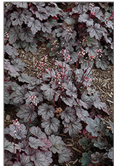
Carnival Rose Granita Coral Bells in bloom