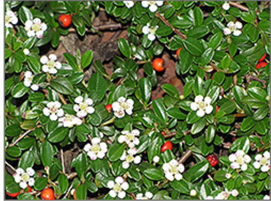
Coral Beauty Cotoneaster fruit

Coral Beauty Cotoneaster will grow to be about 12 inches tall at maturity, with a spread of 5 feet. It tends to fill out right to the ground and therefore doesn't necessarily require facer plants in front. It grows at a fast rate, and under ideal conditions can be expected to live for approximately 30 years.