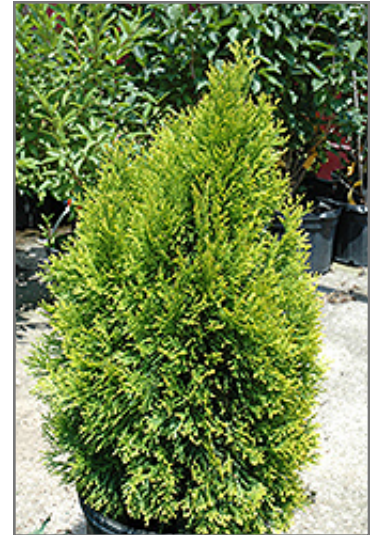
Highlights Arborvitae