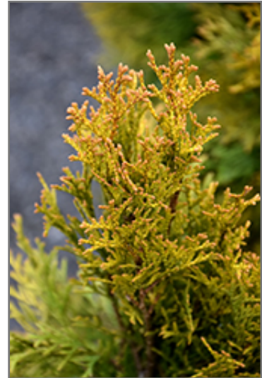
Highlights Arborvitae foliage

This tree does best in full sun to partial shade. It prefers to grow in average to moist conditions, and shouldn't be allowed to dry out. It is not particular as to soil type or pH. It is somewhat tolerant of urban pollution, and will benefit from being planted in a relatively sheltered location. Consider applying a thick mulch around the root zone in winter to protect it in exposed locations or colder microclimates. This is a selection of a native North American species.