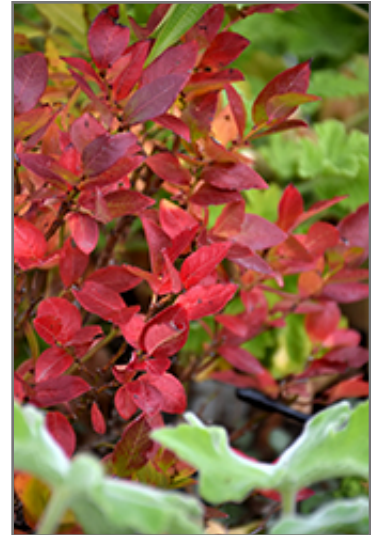
Jelly Bean Blueberry in fall

Jelly Bean Blueberry features dainty clusters of white bell-shaped flowers with shell pink overtones hanging below the branches in mid spring. It has red-variegated green foliage. The glossy oval leaves turn an outstanding red in the fall. It features an abundance of magnificent blue berries in mid summer.