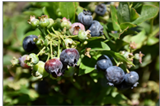
Jelly Bean Blueberry fruit