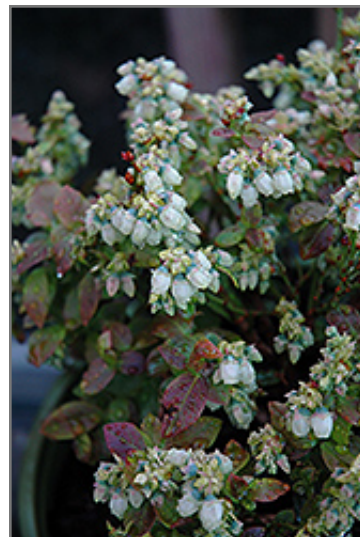
Jelly Bean Blueberry flowers

Jelly Bean Blueberry is a good choice for the edible garden, but it is also well-suited for use in outdoor pots and containers. It can be used either as 'filler' or as a 'thriller' in the 'spiller-thriller-filler' container combination, depending on the height and form of the other plants used in the container planting. It is even sizeable enough that it can be grown alone in a suitable container. Note that when grown in a container, it may not perform exactly as indicated on the tag - this is to be expected. Also note that when growing plants in outdoor containers and baskets, they may require more frequent waterings than they would in the yard or garden.