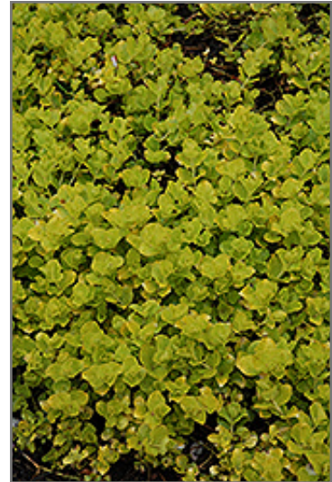
Golden Creeping Jenny foliage

Golden Creeping Jenny is recommended for the following landscape applications;