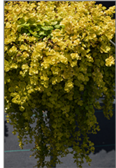
Golden Creeping Jenny foliage

Golden Creeping Jenny is a fine choice for the garden, but it is also a good selection for planting in outdoor containers and hanging baskets. Because of its spreading habit of growth, it is ideally suited for use as a 'spiller' in the 'spiller-thriller-filler' container combination; plant it near the edges where it can spill gracefully over the pot. Note that when growing plants in outdoor containers and baskets, they may require more frequent waterings than they would in the yard or garden.