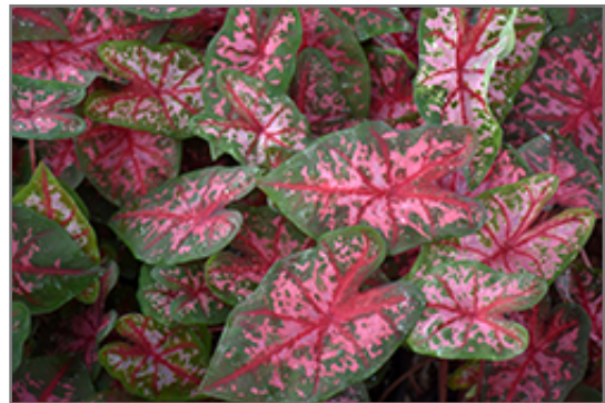
Carolyn Whorton Caladium foliage