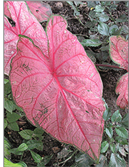
Fannie Munson Caladium foliage

Fannie Munson Caladium is recommended for the following landscape applications;