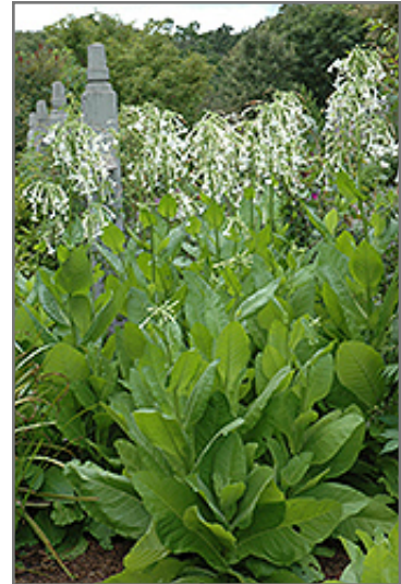
Woodland Tobacco in bloom

This vigorous, rosette forming variety produces tall spikes of long white blooms that look like shooting stars, above large green foliage; very fragrant; a great choice for beds, borders, or containers