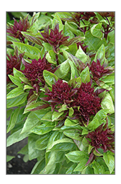
Cardinal Basil flowers

This plant is quite ornamental as well as edible, and is as much at home in a landscape or flower garden as it is in a designated herb garden. It should only be grown in full sunlight. It prefers to grow in average to moist conditions, and shouldn't be allowed to dry out. It is not particular as to soil type or pH. It is somewhat tolerant of urban pollution. This is a selected variety of a species not originally from North America. It can be propagated by cuttings; however, as a cultivated variety, be aware that it may be subject to certain restrictions or prohibitions on propagation.