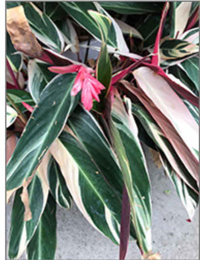
Tricolor Stromanthe flowers

This plant does best in full sun to partial shade. It prefers to grow in average to moist conditions, and shouldn't be allowed to dry out. It is not particular as to soil pH, but grows best in rich soils. It is somewhat tolerant of urban pollution. This is a selected variety of a species not originally from North America. It can be propagated by division; however, as a cultivated variety, be aware that it may be subject to certain restrictions or prohibitions on propagation.