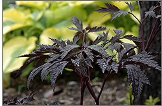
Chocoholic Bugbane foliage