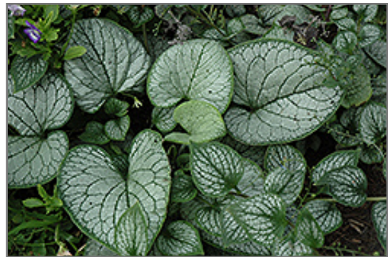
Sea Heart Bugloss foliage