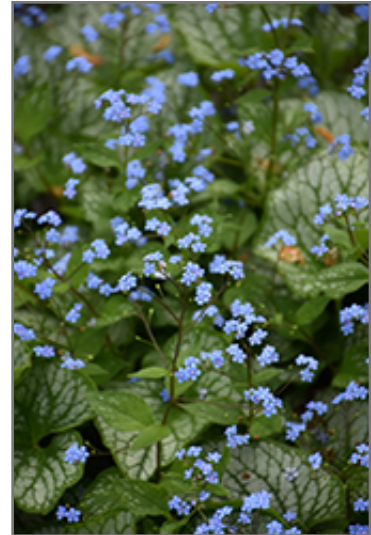
Sea Heart Bugloss flowers

Sea Heart Bugloss is recommended for the following landscape applications;