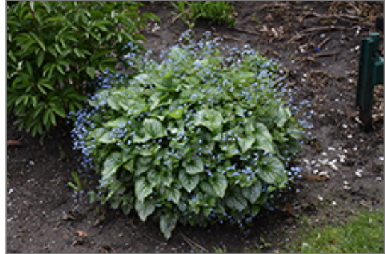
Sea Heart Bugloss in bloom

Sea Heart Bugloss will grow to be about 12 inches tall at maturity extending to 16 inches tall with the flowers, with a spread of 18 inches. When grown in masses or used as a bedding plant, individual plants should be spaced approximately 14 inches apart. It grows at a medium rate, and under ideal conditions can be expected to live for approximately 10 years. As an herbaceous perennial, this plant will usually die back to the crown each winter, and will regrow from the base each spring. Be careful not to disturb the crown in late winter when it may not be readily seen!