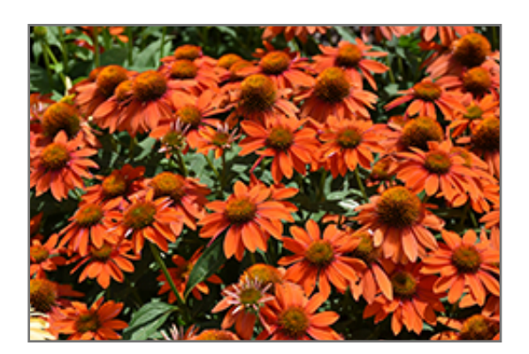
Sombrero Adobe Orange Coneflower flowers