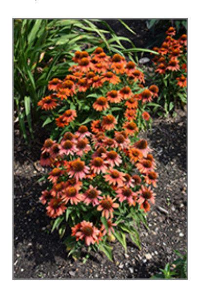
Sombrero Adobe Orange Coneflower in bloom