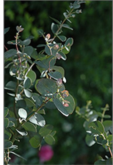
Silver Drop Eucalyptus foliage