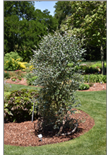
Silver Drop Eucalyptus

Silver Drop Eucalyptus is a fine choice for the garden, but it is also a good selection for planting in outdoor pots and containers. With its upright habit of growth, it is best suited for use as a 'thriller' in the 'spiller-thriller-filler' container combination; plant it near the center of the pot, surrounded by smaller plants and those that spill over the edges. It is even sizeable enough that it can be grown alone in a suitable container. Note that when growing plants in outdoor containers and baskets, they may require more frequent waterings than they would in the yard or garden.