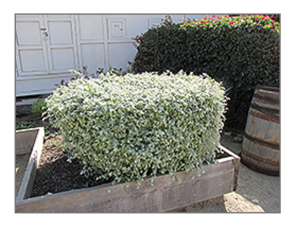
Licorice Plant