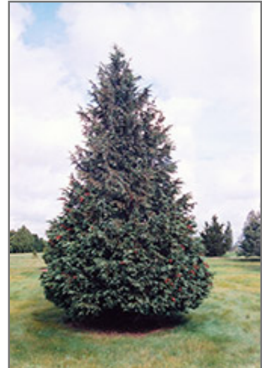
Blue Nootka Cypress

Blue Nootka Cypress will grow to be about 40 feet tall at maturity, with a spread of 20 feet. It has a low canopy with a typical clearance of 3 feet from the ground, and should not be planted underneath power lines. It grows at a medium rate, and under ideal conditions can be expected to live for 70 years or more.