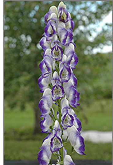
Bicolor Monkshood flowers

A highly toxic, upright perennial that presents hooded white and indigo, bi-colored flowers and dark green ferny foliage; lovely accent for containers and garden beds; prune after flowering; should not be grown around children or in vegetable gardens