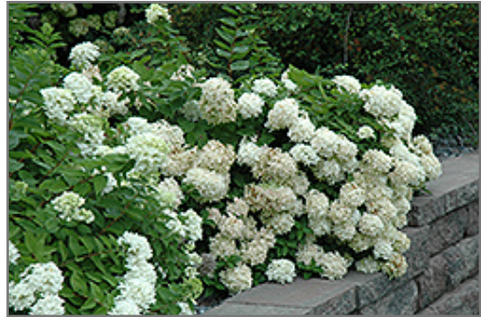
Pee Gee Hydrangea in bloom