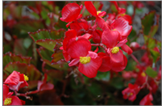
BabyWing Red Begonia flowers

BabyWing Red Begonia is a fine choice for the garden, but it is also a good selection for planting in outdoor containers and hanging baskets. It is often used as a 'filler' in the 'spiller-thriller-filler' container combination, providing a mass of flowers and foliage against which the thriller plants stand out. Note that when growing plants in outdoor containers and baskets, they may require more frequent waterings than they would in the yard or garden.