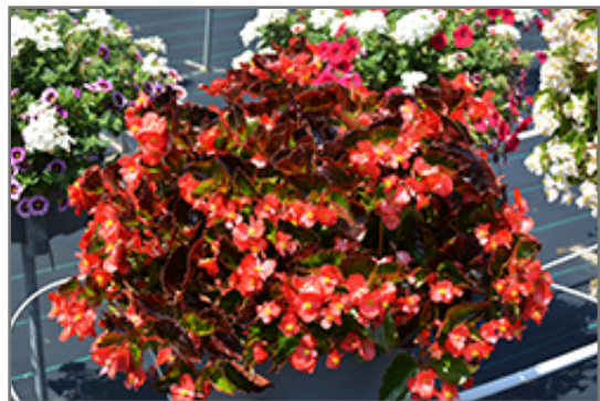
BabyWing Red Begonia in bloom