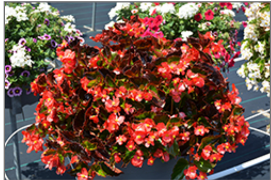
BabyWing Red Begonia in bloom