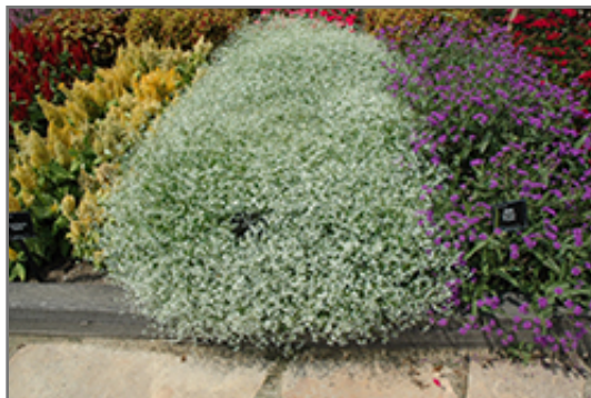
Glamour Euphorbia in bloom

Glamour Euphorbia is a fine choice for the garden, but it is also a good selection for planting in outdoor containers and hanging baskets. It can be used either as 'filler' or as a 'thriller' in the 'spiller-thriller-filler' container combination, depending on the height and form of the other plants used in the container planting. Note that when growing plants in outdoor containers and baskets, they may require more frequent waterings than they would in the yard or garden.