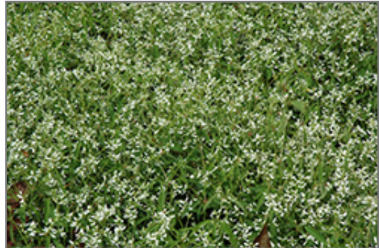
Glamour Euphorbia flowers