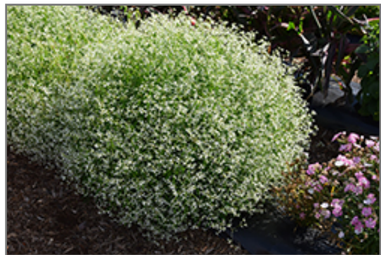
Glamour Euphorbia in bloom