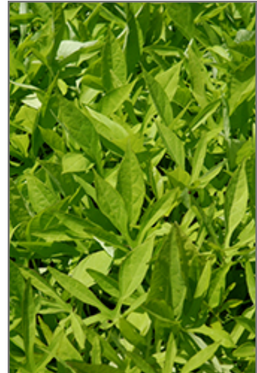
SolarPower Lime Sweet Potato Vine foliage