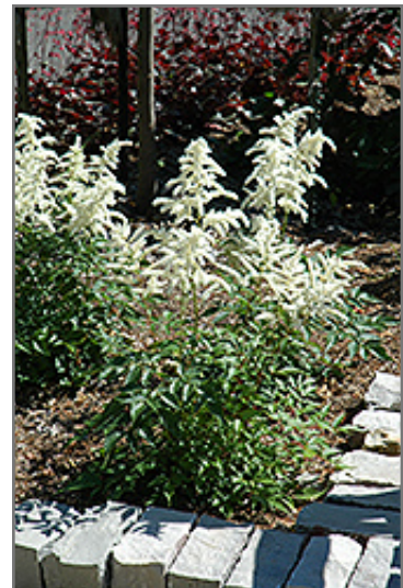
Deutschland Astilbe in bloom