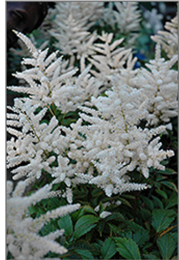
Deutschland Astilbe flowers

Deutschland Astilbe is recommended for the following landscape applications;