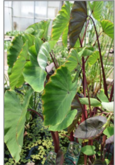
Rhubarb Elephant Ear foliage

Rhubarb Elephant Ear will grow to be about 4 feet tall at maturity, with a spread of 3 feet. Although it's not a true annual, this fast-growing plant can be expected to behave as an annual in our climate if left outdoors over the winter, usually needing replacement the following year. As such, gardeners should take into consideration that it will perform differently than it would in its native habitat.