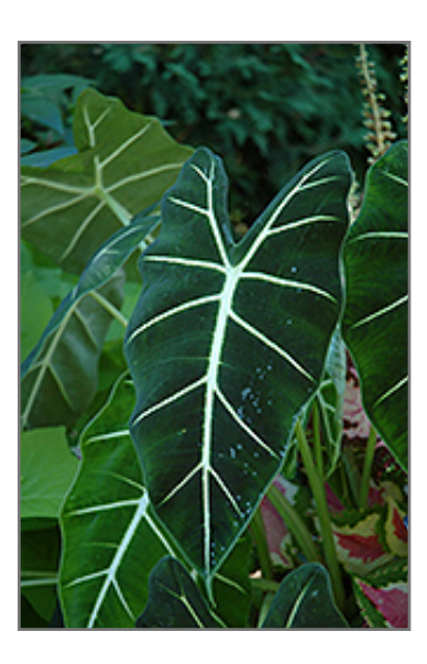
Frydek Elephant's Ear foliage

When grown indoors, Frydek Elephant's Ear can be expected to grow to be about 3 feet tall at maturity, with a spread of 3 feet. It grows at a medium rate, and under ideal conditions can be expected to live for approximately 5 years. This houseplant will do well in a location that gets either direct or indirect sunlight, although it will usually require a more brightly-lit environment than what artificial indoor lighting alone can provide. It is quite adaptable, prefering to grow in average to wet conditions, and will even tolerate some standing water. The surface of the soil should be kept consistently moist all of the time, and you should expect to water this plant two or more times each week, especially if it's growing in a low-humidity environment. Be aware that your particular watering schedule may vary depending on its location in the room, the pot size, plant size and other conditions; if in doubt, ask one of our experts in the store for advice. It is not particular as to soil type or pH; an average potting soil should work just fine. Be warned that parts of this plant are known to be toxic to humans and animals, so special care should be exercised if growing it around children and pets.