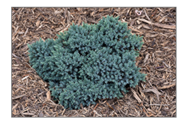
Blue Star Juniper