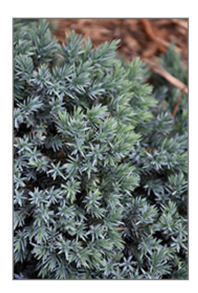
Blue Star Juniper foliage