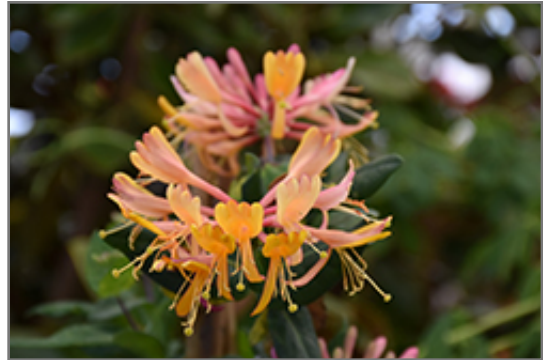
Goldflame Honeysuckle flowers