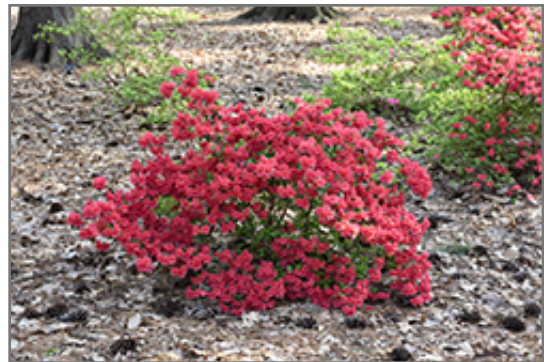
Girard's Crimson Azalea in bloom