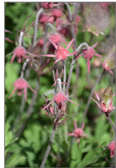
Prairie Smoke flower buds